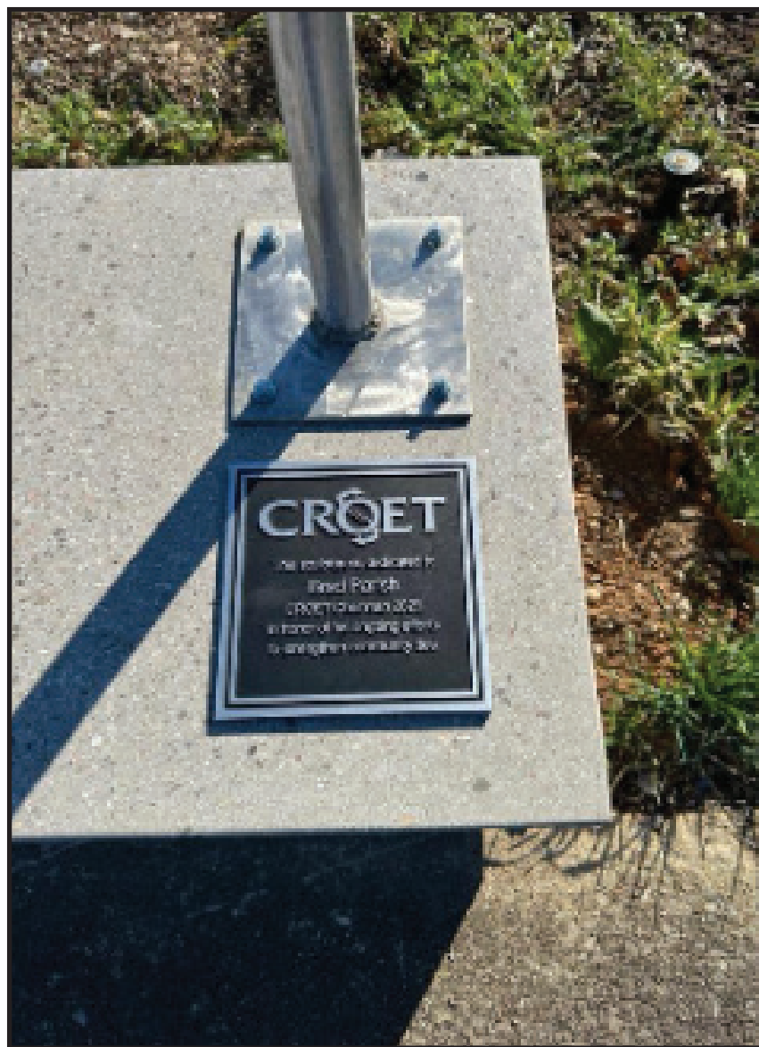
Recognizing Brad Parish for his dedication to strengthening community ties

At the same time, transportation infrastructure was reactivated to support the cleanup effort itself. Rail lines that had once served earlier production missions were brought back into service so trains could again move materials in