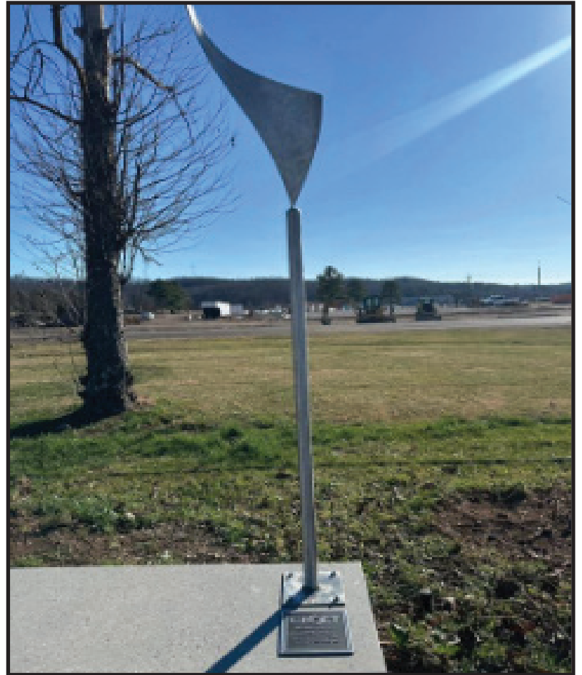
Sculpture located in the Heritage Center, bringing attention to the work done by CROET to transition land to the community

Thanks, Brad, for a very interesting look at your experiences and insights.