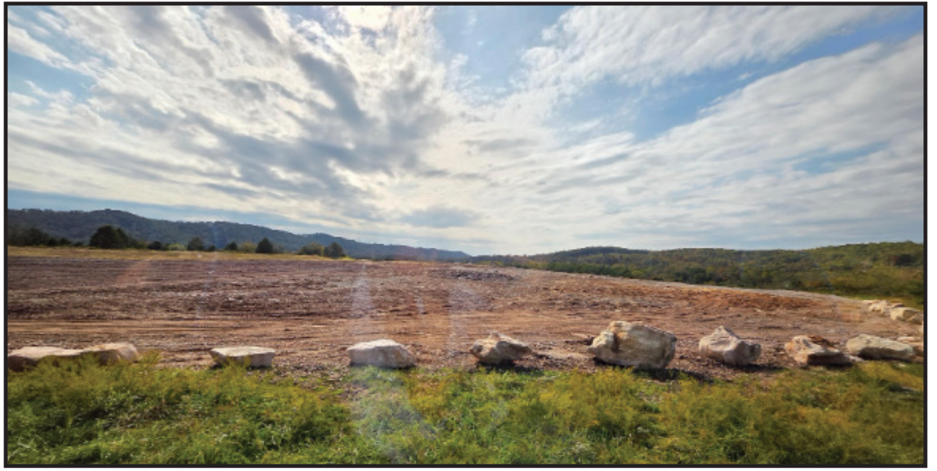
TVA's Clinch River Nuclear Site is being prepared for Small Modular Reactors

An SMR is a compact nuclear reactor that, compared with traditional nuclear power plants, will generate one-third as much electricity (e.g., 300 megawatts electric or MWe) and take up less land than traditional large nuclear power plants