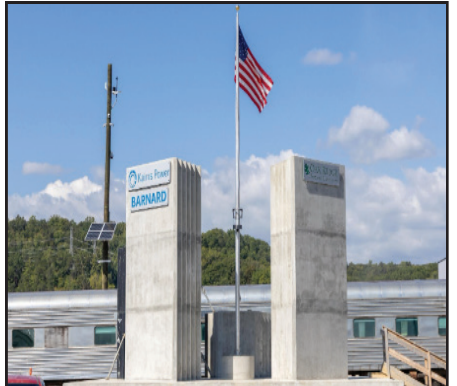
The Janus Project signage

TVA also is a partner of Oklo, which intends to build in Oak Ridge the first privately funded nuclear fuel recycling facility in the United States. With BWXT, TVA is participating in a coalition of major domestic nuclear supply chain partners to ensure the U.S. can domestically manufacture the necessary components for advanced