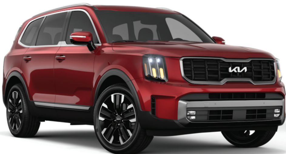
2024 Kia Telluride