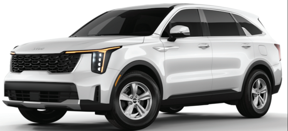
2024 Kia Sorento