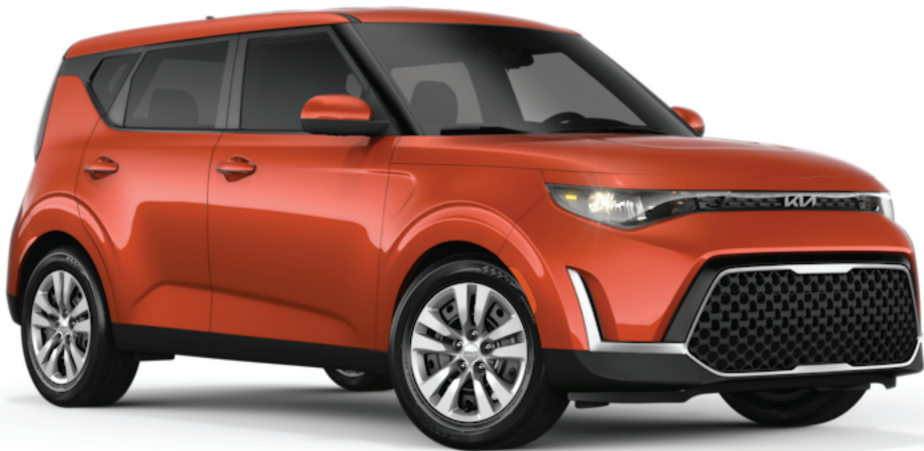
2024 Kia Soul

You'll get it all when you choose Rusty Wallace Kia of Knoxville at Callahan drive!!!