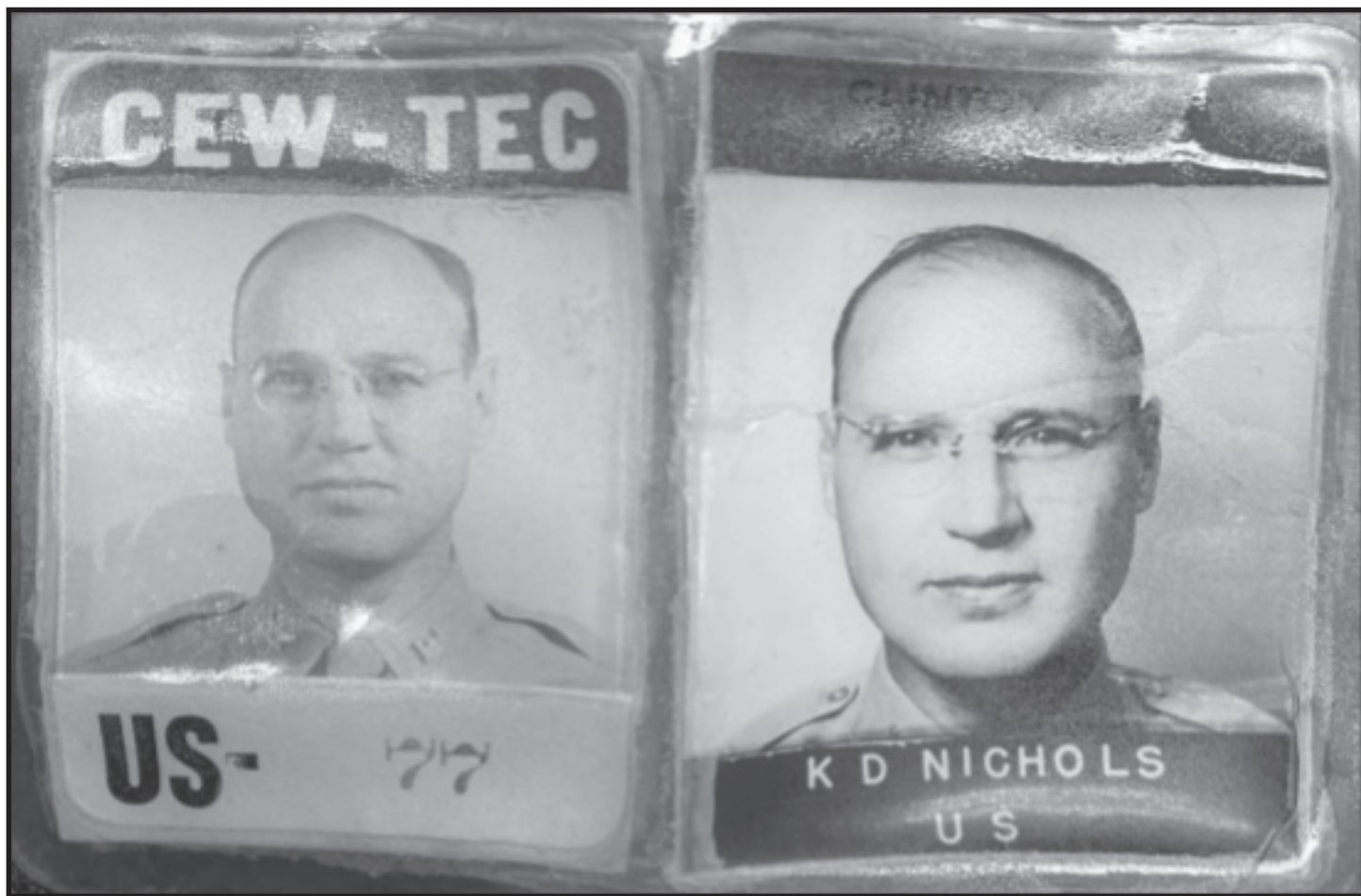
Lt Colonel Kenneth D. Nichols Clinton Engineer Works Identification Card

Recently in 2023 the yellow paper contract was discovered by NHK's production staff