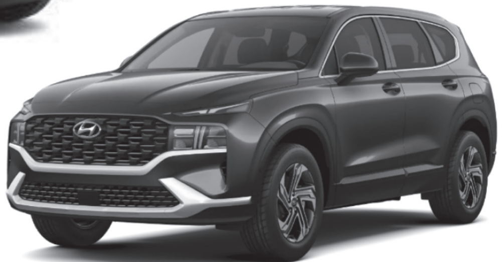
2023 - Santa Fe