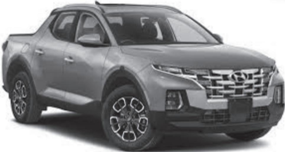
2023 - Santa Cruz