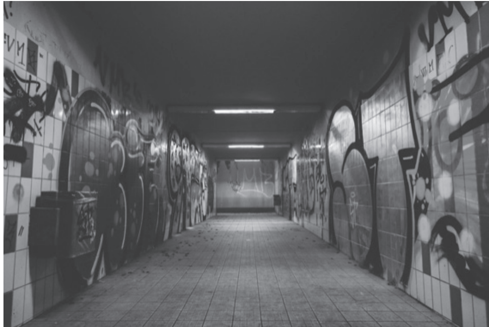
Photo of Subway Graffiti

work. It took a fair amount of courage to travel this way during the 1930s and 40s. Between railroad detectives