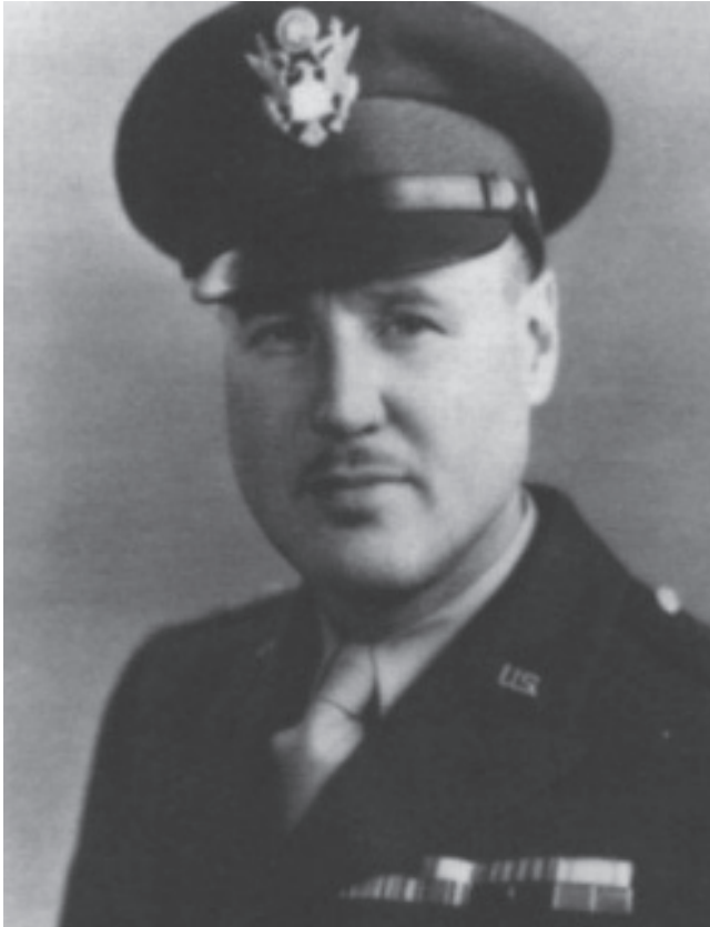
Col. Kenneth Nichols lived in Oak Ridge from 1943 to 1945 when he was second in command to Gen. Leslie Groves, military leader of the Manhattan Project. Nichols became general manager of the U.S. Atomic Energy Commission and, in 1953, initiated the AEC Personnel Security Board hearing on the loyalty and trustworthiness of Robert Oppenheimer, an AEC adviser.

In addition to the usual charges about Oppenheimer's associations with communists and a rejected request that he impart information to a Soviet delegate, he was accused of being "instrumental in persuading other outstanding scientists not to work on the hydrogen bomb project, and