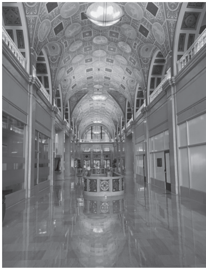
Dixie Terminal Cincinnati, Ohio, Photo Author's Collection

that often assaulted these free riders, to the many criminals who rode from town to town committing crimes, it was a dangerous path to travel.