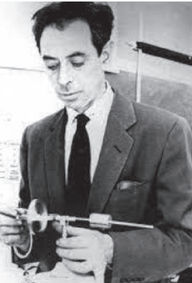
Frank Oppenheimer worked as a physicist at the Y-12 plant in 1943. His older brother, Robert Oppenheimer, would have visited him during his trips to Oak Ridge.

that the opposition to the hydrogen bomb, of which you are the most experienced, most powerful, and most effective member, has definitely slowed down its development."