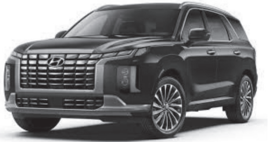
2023 - Palisade